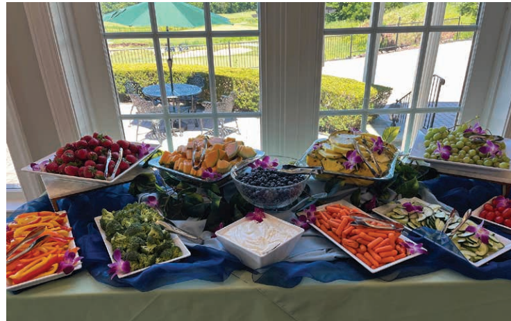
BIGGER SPREAD: Biggerstaff’s Catering, LLC provides catering services for events big and small across Adams County, including cooperative events.

“When COVID-19 hit, things got rough,” she says. “We were virtually shut down for a year, doing just a few things here and there on a very small scale. Luckily, we were able to