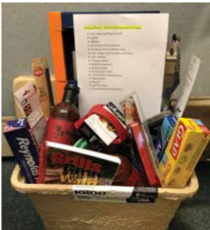
GET COOKIN': “Club baskets,” like the grilling-themed one above donated in 2019, are a big draw at the Adams County 4-H Benefit Auction.

Not an Adams County resident? Wait a few months and York County 4-H has its own benefit auction, planned for March 17, 2023, at the 4-H Center, 771 Stoverstown Road, York. Call 717-840-7408 for more information or to donate. 🌻