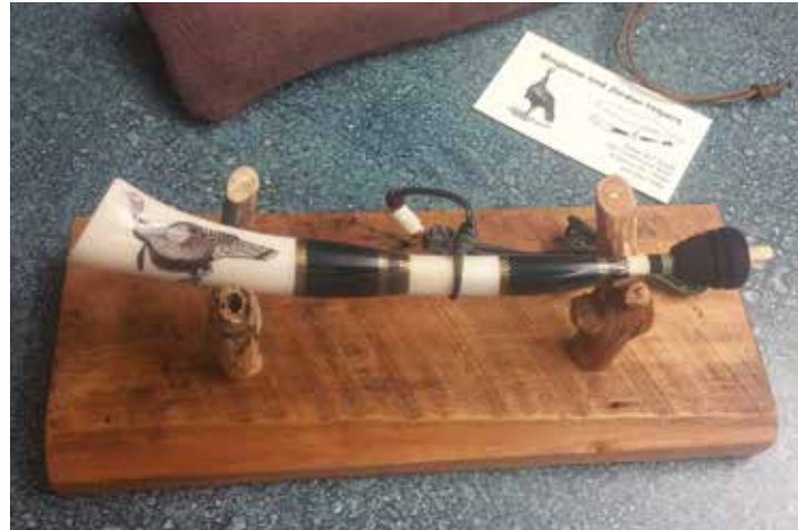
FOR THE BIRDS: This turkey call, made by Wingbone and Jordan Yelpers, is one of the items donated to a recent Adams County 4-H Benefit Auction.

No gift is too big or too little, the co-chairs agree.