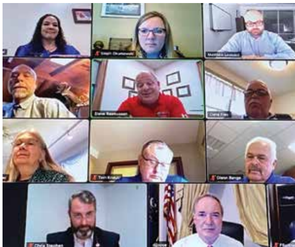
VIRTUAL VISIT: The current state of the nation leaves legislative advocacy to Zoom meetings and virtual discussions.

During the series of meetings, legislators were encouraged to cosponsor the Flexible Financing for Rural America Act, which supports about 500 electric cooperatives across the country that use or have used financing from the Rural Utilities Service (RUS). Unlike most loans, RUS loans cannot be refinanced to take advantage of lower interest rates available in the private sector, without penalty. As a result,